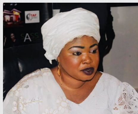
Rohey Malick Lowe Lord Mayor of Banjul, Gambia